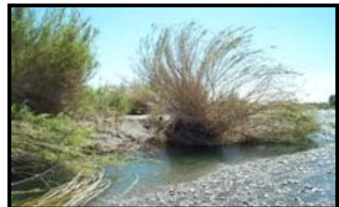
Arundo donax & Tamarisk dominates Stony Creek