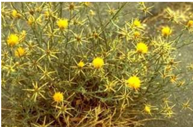
Yellow Star Thistle